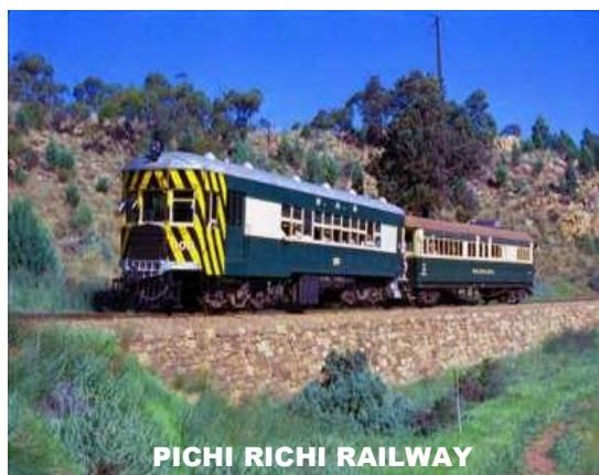
PICHI RICHI RAILWAY